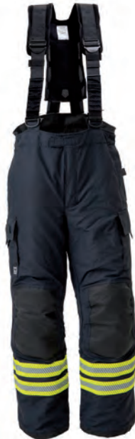
VIKING PS1050 Model 574 Profi

Jacket and trousers are available in several layer combinations.