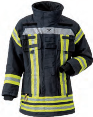
VIKING PS1000 Model 083 Profi

A short, high performance jacket with a great fit. Also available with 3M® FR comfort that can withstand up to 50 washes.