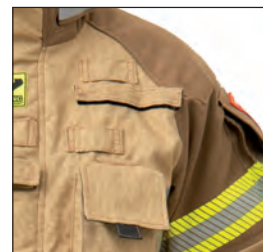
Yoke attachments with protective covering