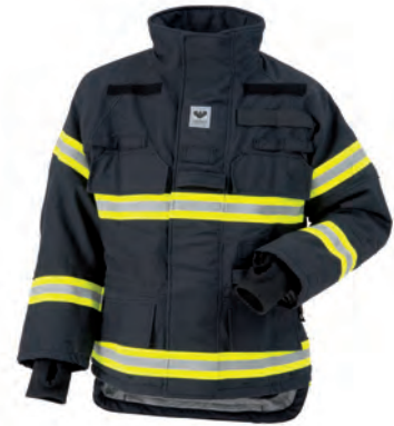
VIKING PS1000 Model 096

A short, high performance jacket with a great fit. Also available with 3M® FR comfort that can withstand up to 50 washes.