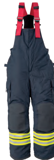
VIKING PS1050 Model 587

The waist trousers are compatible with short and medium VIKING jackets. Includes padded, adjustable H suspenders to distribute pressure points and provide better comfort.